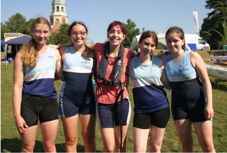
Ladies Novice coxed fours