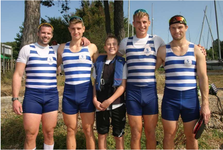
Men's Senior coxed fours