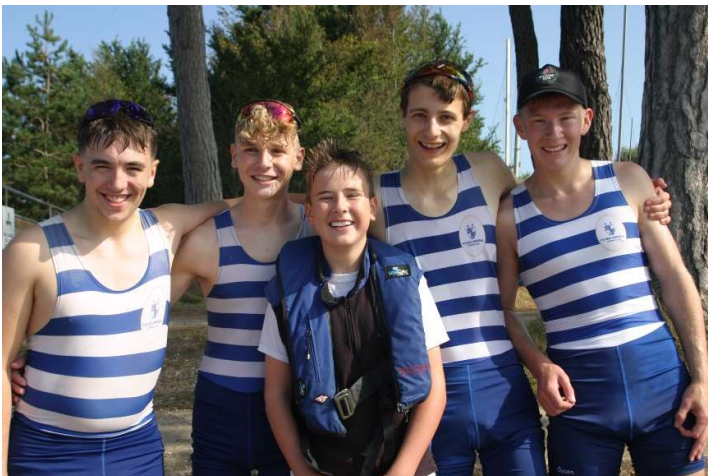
Men's Junior coxed fours.