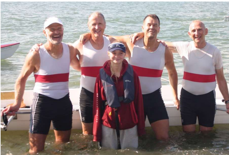
Mixed Masters coxed fours (50+)